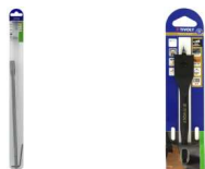
Extensions L300 mm - Hexagonal shank ESSENTIAL (Blister)