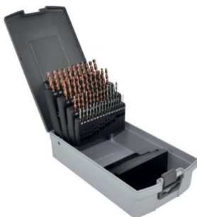
51 FUSIO HSS drill bits Ø 1 to 6 mm by 1/10 Plastic case