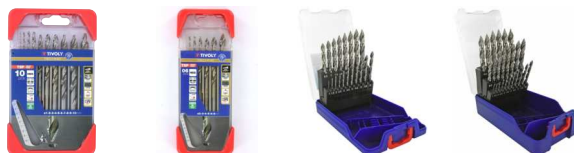
10 HSS metal drill bit Grinding Tivoly Smart Point Ø 1 to 10mm 6 HSS metal drill bit Grinding Tivoly Smart Point Ø 1 to 8mm 19 HSS metal drill bit Grinding Tivoly Smart Point Ø 1 to 10mm 25 HSS metal drill bit Grinding Tivoly Smart Point Ø 1 to 13 mm