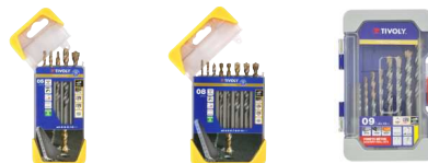
5 SLR graduated concrete drill bits Ø 4 to 10 mm 8 SLR graduated concrete drill bits Ø 3 to 10 mm 9 SLR graduated concrete drill bits Ø 3 to 12 mm