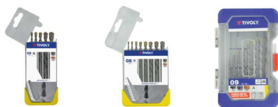
5 concrete drill bits Ø 4 to 10 mm 8 concrete drill bits Ø 3 to 10 mm 9 concrete drill bits Ø 3 to 12 mm