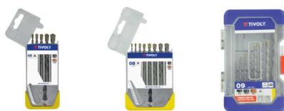
5 concrete drill bits Ø 4 to 10 mm 8 concrete drill bits Ø 3 to 10 mm 9 concrete drill bits Ø 3 to 12 mm