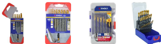
6 fully ground TiN coated HSS metal drill bits, split point - Tri-flat shank Ø 2 to 8 mm 10 fully ground TiN coated HSS metal drill bits, split point - Tri-flat shank Ø 1 to 10 mm 18 fully ground TiN coated HSS metal drill bits, split point - Tri-flat shank Ø 2 to 10 mm 25 fully ground TiN coated HSS metal drill bits, split point - Tri-flat shank Ø 1 to 13 mm